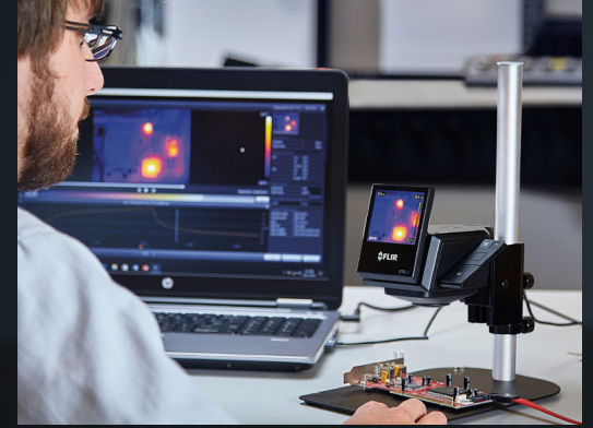
Connect over USB a computer to analyze data in FLIR Tools+

Determine where to add or remove thermal management devices