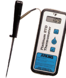
Platinum RTD Dial Thermometer