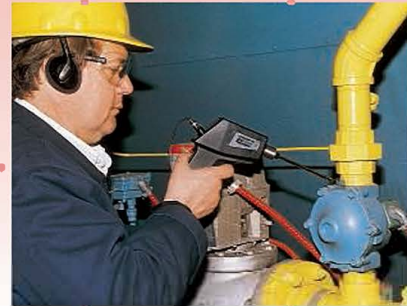
Ultraprobe 100 testing pump valve leaks

The Ultraprobe® 100 is a practical tool for any leak detection, steam trap inspection or mechanical troubleshooting program. Simple to use — find compressed air and steam leaks and prevent machinery failure with this unique instrument.