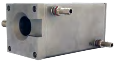
Water cooling enclosure with air purge collar

The Thermoview TV30 Thermal Imager provides process control and monitoring capabilities for industrial applications. The fixed thermal imager's small footprint allows for easier installation, while multiple fieldbus options simplify integration with your existing process controllers and external devices. The TV30 is a rugged product for the industrial applications Fluke Process Instruments has been serving for years.