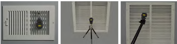
Suspend from grille