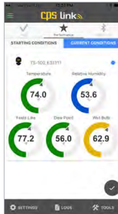
Current Conditions Screen