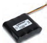
7.2V/5.2Ah Li-ion battery Pack