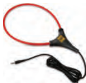
Rogowski Coil (200A)