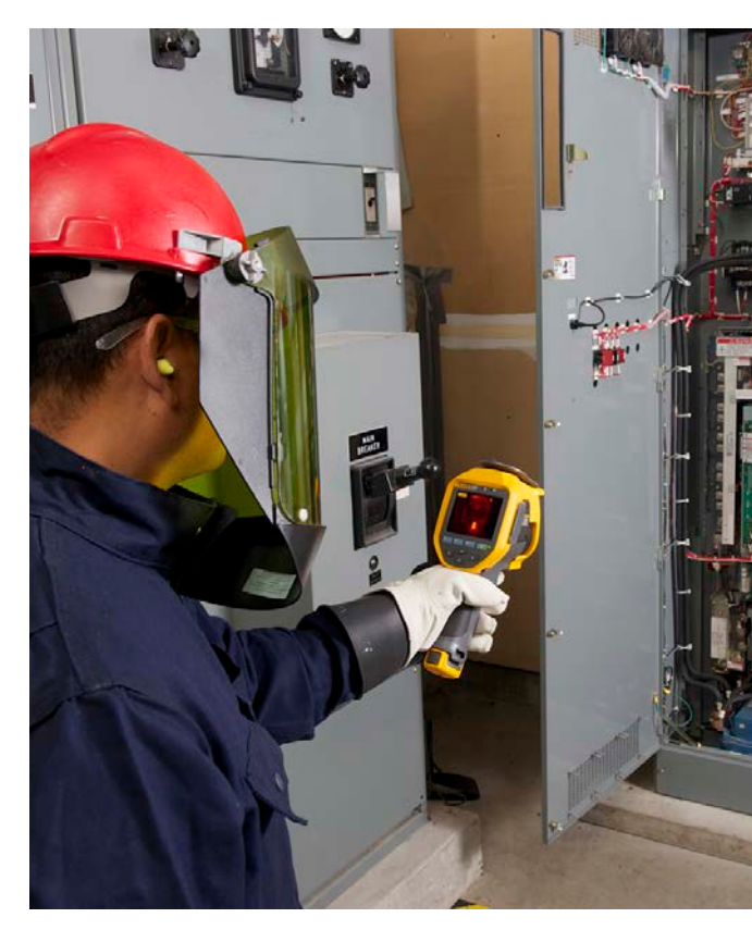
When scanning a live electrical panel, wear appropriate 70E personal protective equipment for arc flash and stand at least four feet away.