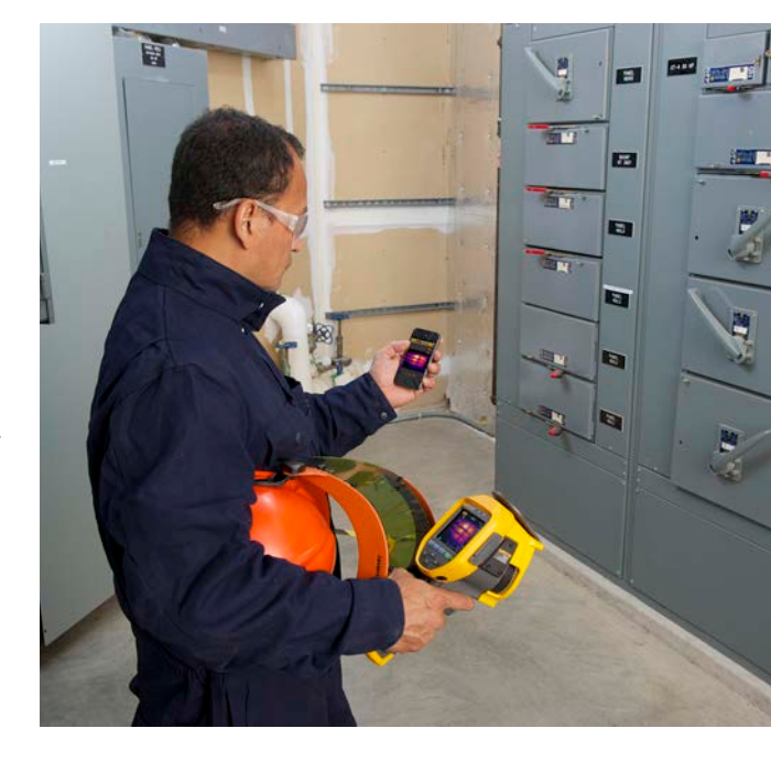
Create an inspection report while still at the inspection site and communicate directly to your client or manager via your Apple®, iPhone® or iPad®.

than ambient, it's difficult to detect problems with thermal imagery.) Incorporate the guidelines above for connections and imbalances. The cooling tubes should appear warm. If one or more tubes is comparatively cool, oil flow is probably restricted. Keep in mind that like an electric motor, a transformer has a minimum operating temperature that represents the maximum allowable rise in temperature above ambient (typically 40 °C). A 10 °C rise above the nameplate operating temperature will probably reduce the transformer's life by 50 percent.