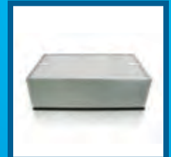
F057 Medical Grade HEPA