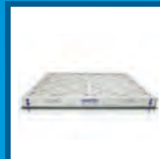
F265 Pleated Pre-filter