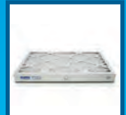
F007 Pleated Pre-filter