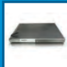
F045 Chemical Filter