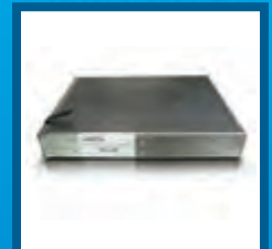
F033-GPC Chemical Filter