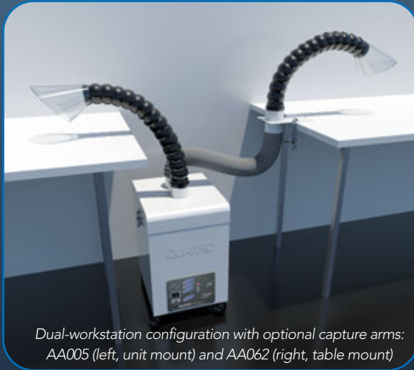
Dual-workstation configuration with optional capture arms: AA005 (left, unit mount) and AA062 (right, table mount)