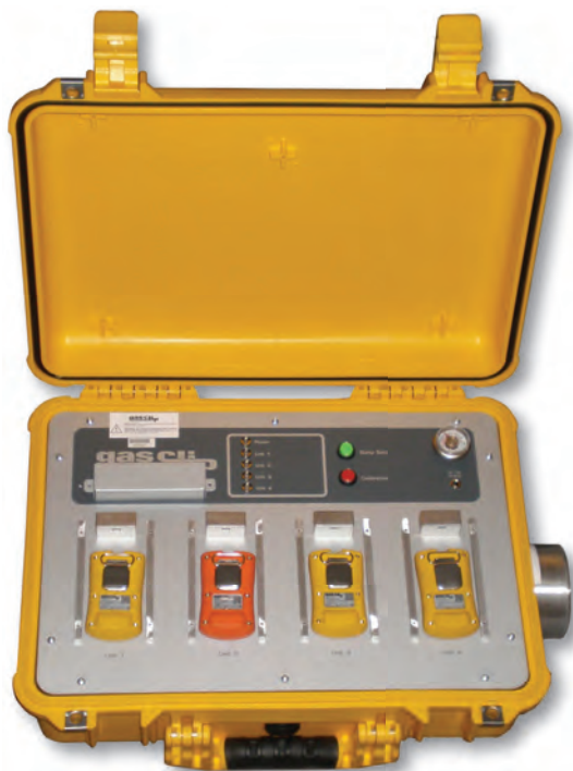
"Clip Dock" Docking Station