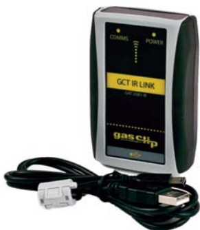
GCT IR Link