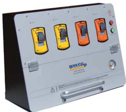
SGC Wall Mount Dock