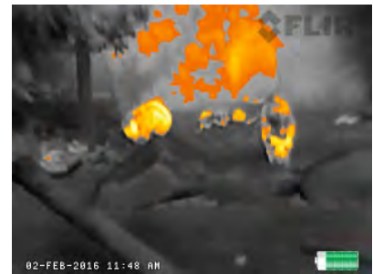
Graded Fire 1&2: The hottest things in the image are shown in a gradient of color while everything else is greyscale