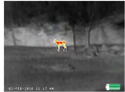
InstAlert: The hottest object in the image is colored while everything else is greyscale