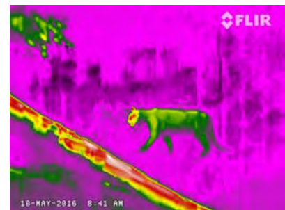
Rain: Well-suited for low-contrast scenes

This product is subject to United States export regulations and may require US authorization prior to export, reexport, or transfer to non-US persons or parties. Diversion contrary to US law is prohibited.