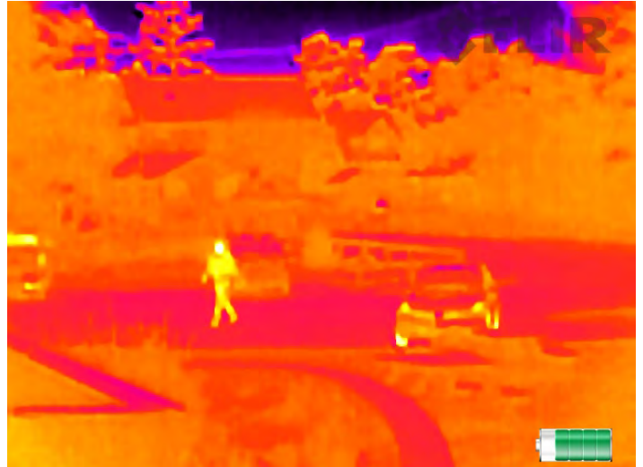
The FLIR Scout TKx helps you stay aware in the dark of night

The FLIR Scout TKx is a pocket-sized thermal vision monocular for exploring the outdoors at night and in lowlight conditions. This thermal monocular with an extended battery life reveals your surroundings, allowing you to clearly see people, objects, and animals from more than 90 meters (100 yards) away. The Scout TKx records thermal images or video in multiple color palettes that can enhance viewing, including InstAlert™—a greyscale palette that adds color to highlight the hottest object in the scene. Simple to use, the Scout TKx is the perfect companion, whether in the countryside or on your own property.