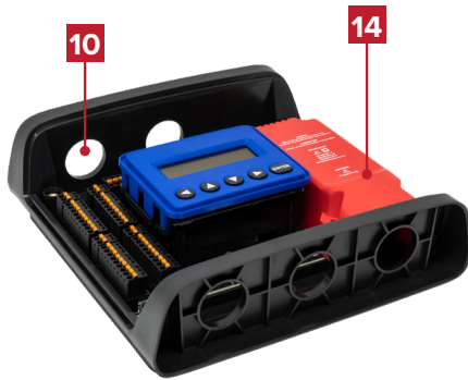
Pictured with High Voltage Cover removed.