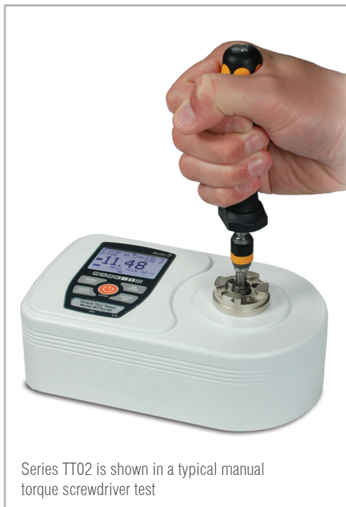
Series TT02 is shown in a typical manual torque screwdriver test

Series TT02 Torque Tool Testers present a simple and accurate solution for testing manual, electric, and pneumatic torque screwdrivers, wrenches, and other tools. These testers are compact and rugged, suitable for production environments. A universal 3/8" square receptacle accepts common bits and attachments. The TT02 captures peak torque in both measurement directions, and also calculates 1st and 2nd peaks, useful for click-type tools.