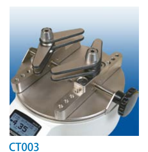
Adjustable jaws Rubber-edged arms may be independently repositioned to accommodate unique samples.