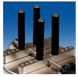
CT005 / CT006 / CT007 Extended length post sets

CT005: Four 2.5" (63 mm) posts CT006: Four 4" (101 mm) posts CT007: Kit of four of each length: