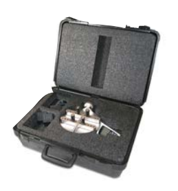
CT002 Carrying case Provides storage space for the TT01 tester, gripping jaws, AC adapter, and accessories.