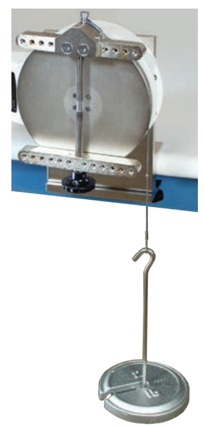
Calibration kit Complete set of brackets, cable, and hardware for calibration of any Series TT01 torque tester. Weights not available from Mark-10.