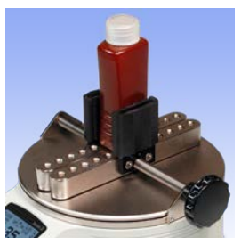
Flat jaws Set of rubber jaws for gripping square or odd shaped containers.