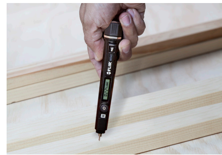
Quick and easy to use; reliable and accurate results