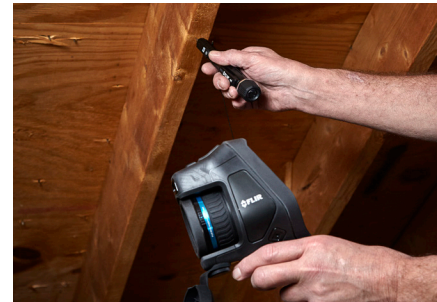
Use MR40 to confirm whether the cold spot found in a thermal image is moisture