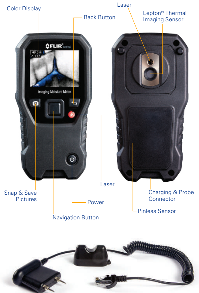
MR02 Pin Probe included