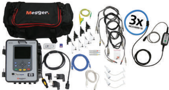
MPQ2000 Silver Kit C/N MPQ2000-S-KIT

Includes MPQ2000 analyzer, voltage leads, SD card, USB cable, ethernet cable, universal power cords, soft-sided carry bag, plus fused adapters and 3 MCCV6000-27 (four range flex 27 cm ID) CTs