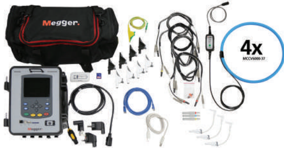
MPQ2000 Platinum Plus Kit C/N MPQ2000-P-KIT-PLUS

Includes MPQ2000 analyzer, voltage leads, SD card, USB cable, ethernet cable, universal power cords, soft-sided carry bag, plus fused adapters and 4 MCCV6000-37 (four range flex 37 cm ID) CTs