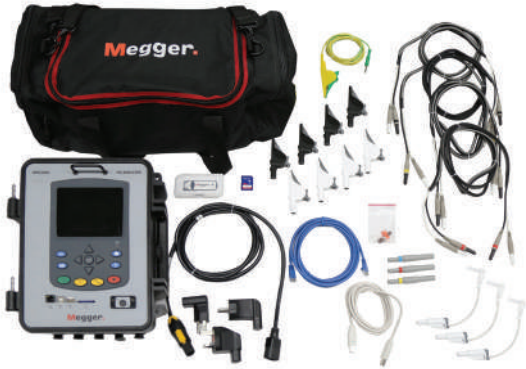
MPQ2000 Basic Kit C/N MPQ2000-BASIC

Includes MPQ2000 analyzer, voltage leads, SD card, USB cable, ethernet cable, universal power cords, soft-sided carry bag plus fused adapters. Does not include current clamps.