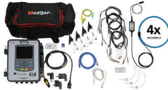
MPQ2000 Gold Plus Kit C/N MPQ2000-G-KIT-PLUS

Includes MPQ2000 analyzer, voltage leads, SD card, USB cable, ethernet cable, universal power cords, soft-sided carry bag, plus fused adapters and 3 MCCV6000-18 (four range flex 18 cm ID) CTs