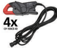
Kit of 4 split core self ID 100A PQ CT C/N CP-100CE-ID-KIT

Split core current clamp for the MPQ and PA9 series. Self-identifying on MPQ. Supports 1000A range. 6 in. (1.82 m) cord.