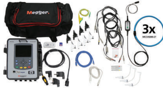
MPQ2000 Gold Kit C/N MPQ2000-G-KIT

Includes MPQ2000 analyzer, voltage leads, SD card, USB cable, ethernet cable, universal power cords, soft-sided carry bag plus fused adapters. Does not include current clamps.