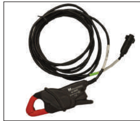
CP-5CE-ID, CP-20CE-ID, CP-100CE-ID

Fuses come with a kit of multi-color clip on bands. Configure the fuse adapters to match the color code of your voltage lead.