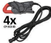
Kit of 4 split core self ID 5A PQ CT C/N CP-5CE-ID-KIT

Split core current clamp for the MPQ and PA9 series. Self-identifying on MPQ. Supports 20A range. 6 in. (1.82 m) cord.