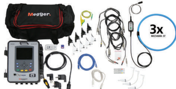
MPQ2000 Platinum Kit C/N MPQ2000-P-KIT

Includes MPQ2000 analyzer, voltage leads, SD card, USB cable, ethernet cable, universal power cords, soft-sided carry bag, plus fused adapters and 4 MCCV6000-18 (four range flex 18 cm ID) CTs