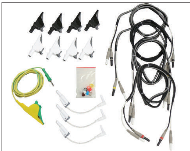
Voltage Lead Set (2007-216)