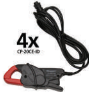
Kit of 4 split core self ID 20A PQ CT C/N CP-20CE-ID-KIT

Split core current clamp for the MPQ and PA9 series. Self-identifying on MPQ. Supports 100A range. 6 in. (1.82 m) cord.