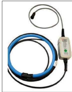
MCCV6000-18 MCCV6000-27 MCCV6000-37