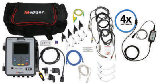
MPQ2000 Silver Plus Kit C/N MPQ2000-S-KIT-PLUS

Includes MPQ2000 analyzer, voltage leads, SD card, USB cable, ethernet cable, universal power cords, soft-sided carry bag, plus fused adapters and 4 MCCV6000-27 (four range flex 27 cm ID) CTs