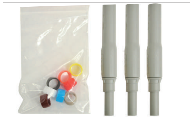
Optional Fuse Adapter Kit (1008-645)