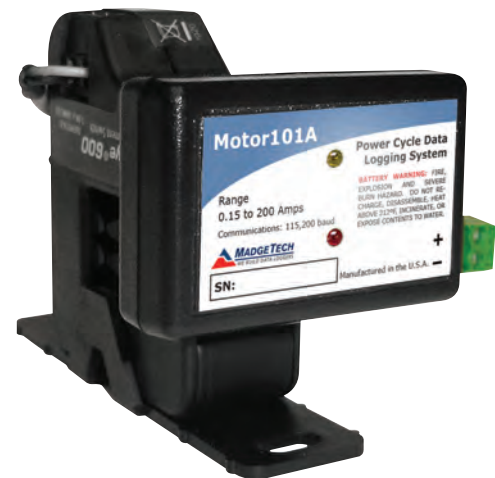
Motor101A Power Cycle Data Logging System

Specifications subject to change. See MadgeTech's terms and conditions