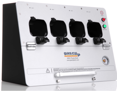
MGC Pump Wall Mount Dock