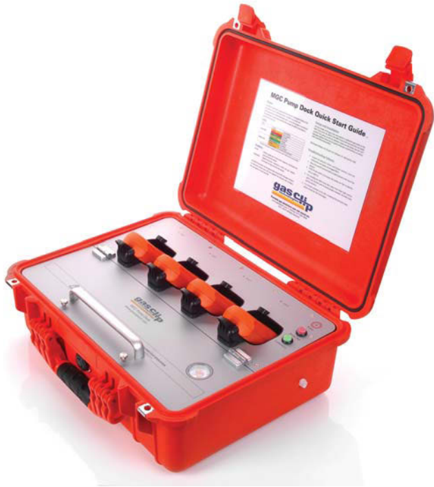
MGC Pump Dock