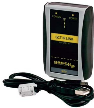
GCT IR Link

10' Sampling Hose 10 Additional Filters; 5 Hydrophobic and 5 Particulate Stainless Steel Diffusion Stone