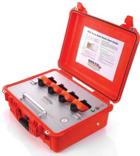
MGC Pump Dock