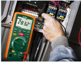
Voltage check on motor starter