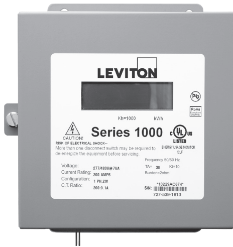
Indoor JIC Steel Enclosure