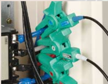
Can clip insulated cables