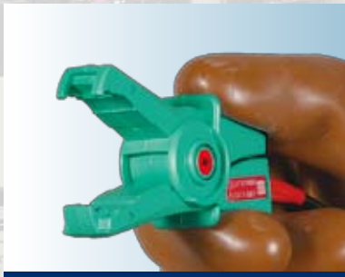
For cables from \phi 2.4 to 30mm

Safe Testing without direct contact with live wires!!