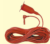
7253 Longer line probe with alligator clip(15m)