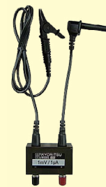
8302 Adaptor for recorder (Output 1mV/1μA)