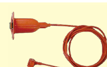
7168A Line probe with alligator clip(3m)