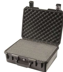
iM2400-X0001 With Foam