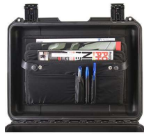
iM24XX-LIDORG Lid Organizer