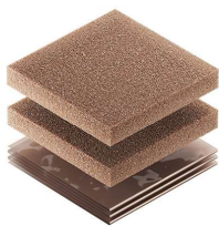
1500CI Corrosion Intercept