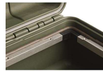
iM24XX-BEZEL Base Bezel Kit