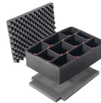
iM2400TPKIT TrekPak Case Divider Kit