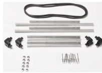
iM24XX-BEZEL-LID Lid Bezel Kit