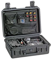
iM24XX-PHOTO PALLET Photography Pallet