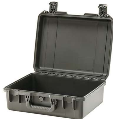
iM2400-X0000 No Foam