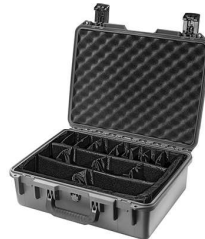
iM2400-X0002 With Padded Dividers