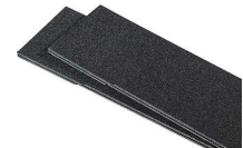
1300TPDIV Extra TrekPak Dividers