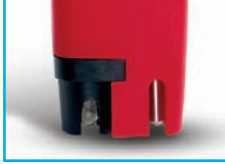
Exposed temp sensor for fast response time