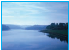
Lakes and rivers