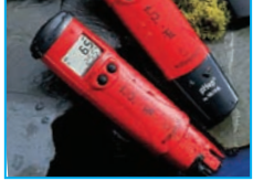
Floating waterproof case