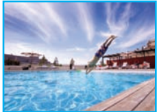
Swimming pools and spas