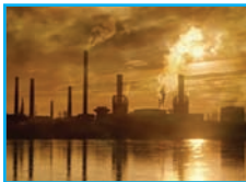
Test pH in boilers and cooling towers

Waterproof, accurate and portable, these handy little pocket meters are true 'go-anywhere' pH testers with replaceable electrodes.