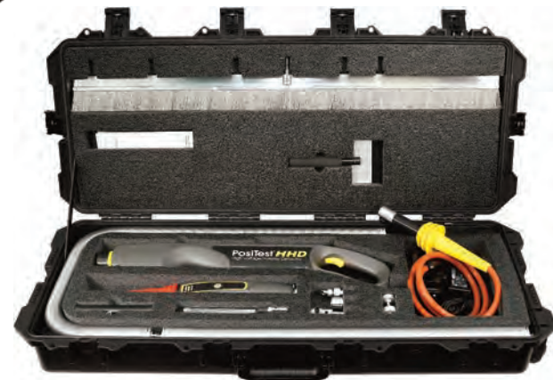
PosiTest HHD shown with optional electrodes and accessories