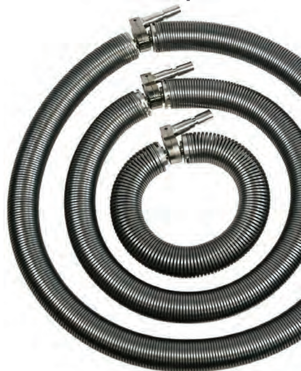
Rolling Spring Electrodes

† The PosiTest HHD is compatible with SPY coils, brushes and accessories.