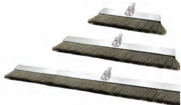
Flat Wire Brush Electrodes