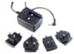
Multiregion power supply