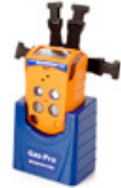
Chest harness straps