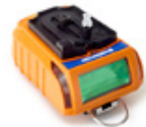
Pumped flow plate