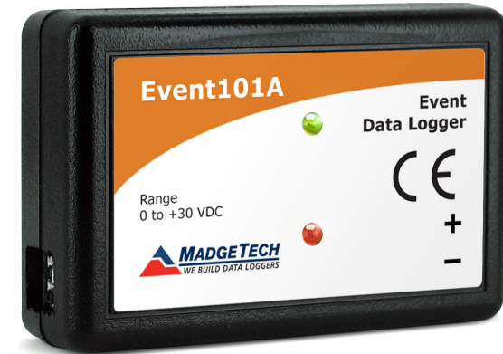
Event101A Event Data Logger with a 10 Year Battery Life

WARNING: FIRE, EXPLOSION, AND SEVERE BURN HAZARD. DO NOT SHORT CIRCUIT, CHARGE, FORCE OVER DISCHARGE, DISASSEMBLE, CRUSH, PENETRATE OR INCINERATE. BATTERY MAY LEAK OR EXPLODE IF HEATED ABOVE 80°C (176°F).