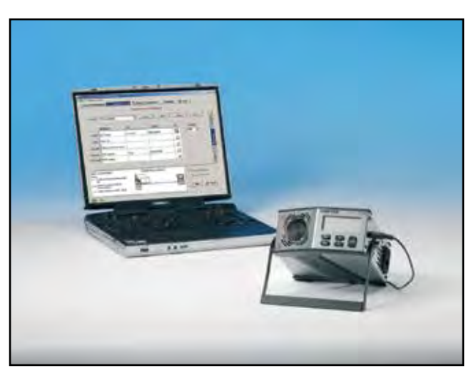
Use the ETC calibrator with JOFRACAL calibration software

The ETC- series has a very easy and straightforward procedure for re-calibration/adjustment. There is no need for a screwdriver or PC software. The only thing you need is a reliable reference thermometer. Place the probe in the calibrator and follow the instructions on the display.