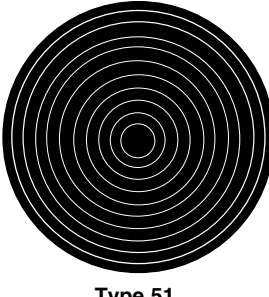
Type 51 ETC-400 R 36 mm (1.4 in) target

NOTE: All ETC400 calibrators are with fixed inserts. They can NOT be changed.