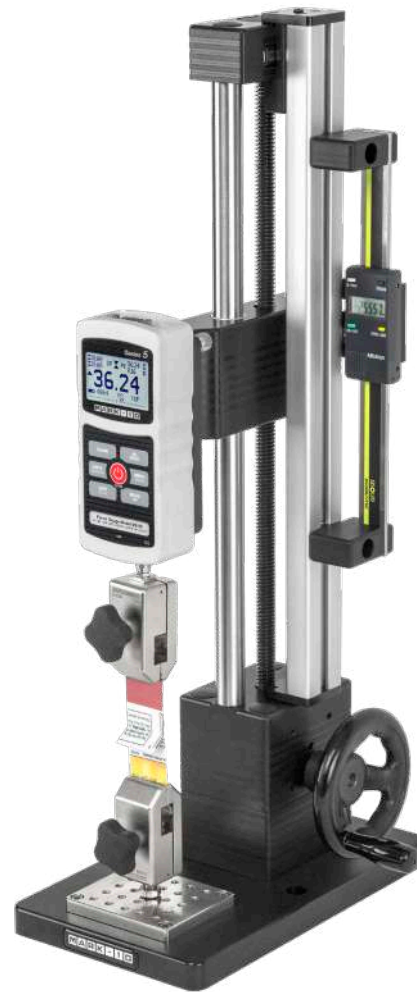
The ES30 is shown in a typical peel testing application, with Series 5 digital force gauge, digital travel display, and film & paper grips.