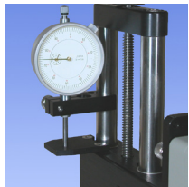
Dial travel indicator