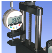
Digital travel indicator