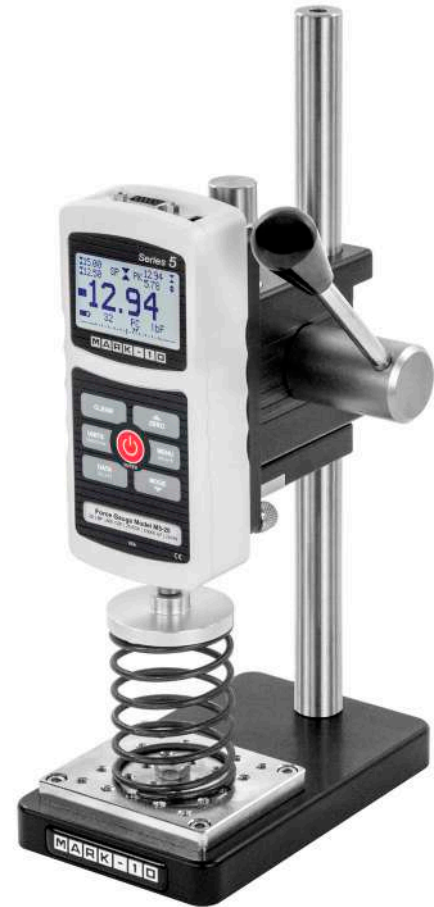
The ES05 is shown in a spring compression test, with Series 5 digital force gauge and 2" compression plate