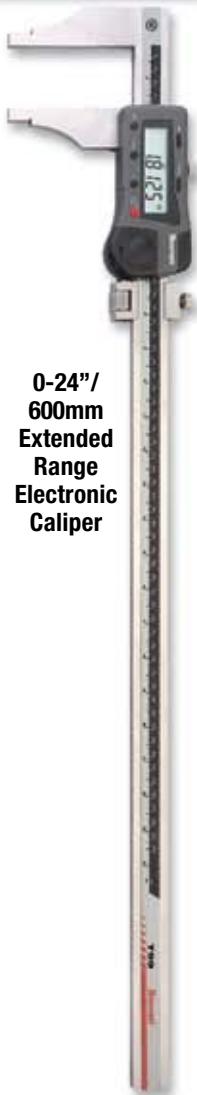
0-24" / 600mm Extended Range Electronic Caliper