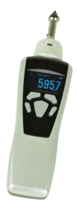
DT-2100 Shown with Contact Adapter & Cone