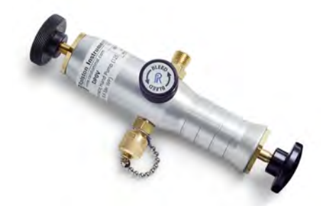
DP0V Pressure Hand Pump