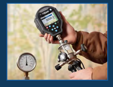
Gauges & Calibration References

Ralston Instruments provides complete pressure calibration solutions for a wide range of applications, saving time and taking the guesswork out of critical pressure testing, maintenance and repair operations.