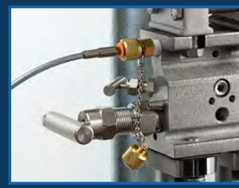
High Pressure Hoses & Quick-test Connections