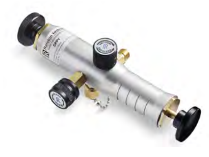
DPPV Pressure/Vacuum Hand Pump