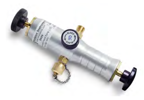
DV0V Vacuum Hand Pump

For precise low pressure or vacuum calibration