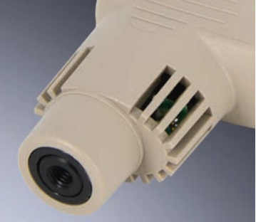
PosiTector DPM IR probe includes a noncontact infrared surface temperature sensor.