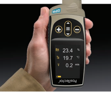
PosiTector DPM A shown with NEW Auto rotating display with Flip Lock.

Hot-wire anemometer with your choice of wind speed measurement units — m/s, km/h, mph, ft/s, ft/m, knots. DPM A models only.