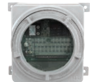
DCT in optional explosion-proof enclosure.