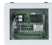
DCT in optional NEMA 4/4X weatherproof enclosure.