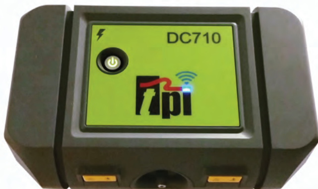
DC710 Photo Actual Size

Connection for ambient temperature probe.