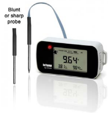
Blunt or sharp probe