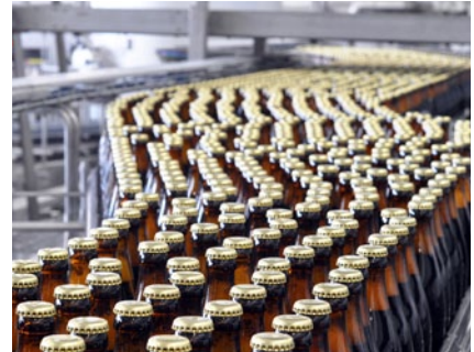
Leak monitoring in filling plants (safety)