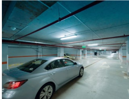
Monitoring in underground garages (safety)