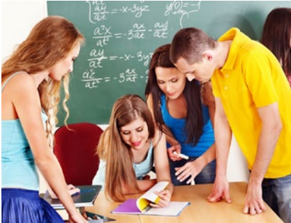
Indoor air quality