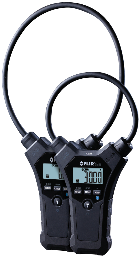
CM57 & CM55 Flexible Clamp Meters