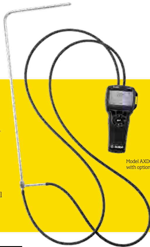
Model AXD620 shown with optional pitot probe

The AXD620 is a rugged, compact, comprehensive Micromanometer that measures pressure, and calculates velocity and volumetric flow rate. It can be used with Pitot tubes to measure velocity and then calculate flow rates with user-input duct size and shape. Premium features make it ideal for HVAC, environmental safeguards, commissioning, process control and system balancing.