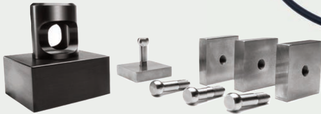
PosiTest AT 50T KIT measures the tensile strength of ceramic tile adhesives.