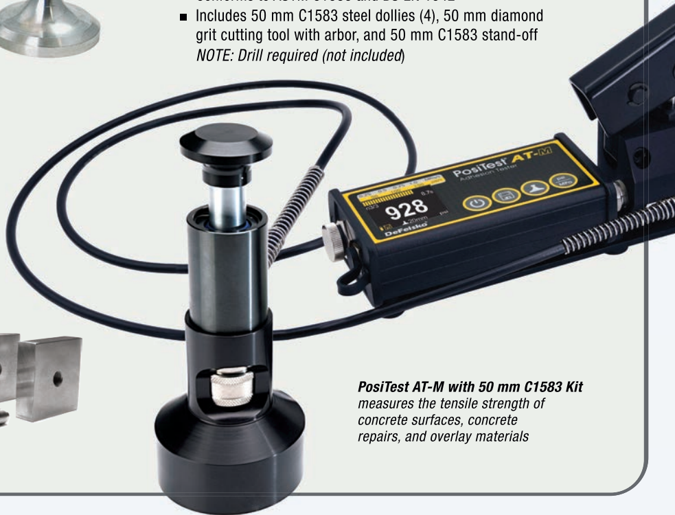
PosiTest AT-M with 50 mm C1583 Kit measures the tensile strength of concrete surfaces, concrete repairs, and overlay materials