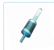
Zero Filter for Calibration (Si-AQ VOC Zero Filter)