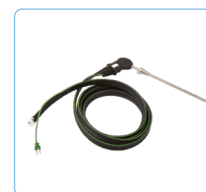
Sampling Probe (Si-AQ Probe with Hose)