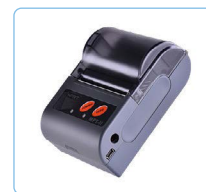
Bluetooth® Printer (Si-AQ Bluetooth® Printer)