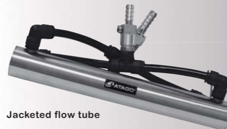
Jacketed flow tube