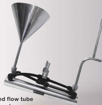
Jacketed flow tube with funnel