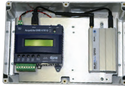
Acquisuite EMB (A7810)