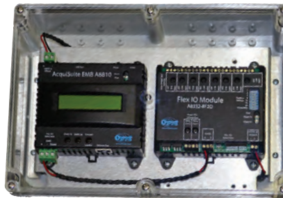
Acquisuite EMB (A8810)