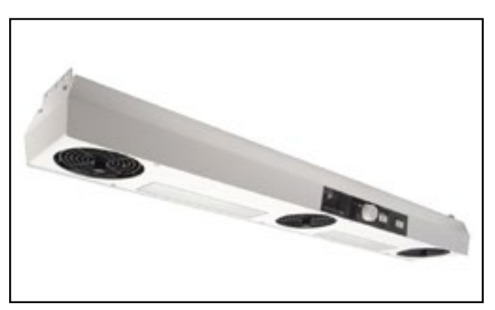
Figure 1. SCS 991A Overhead Air Ionizer