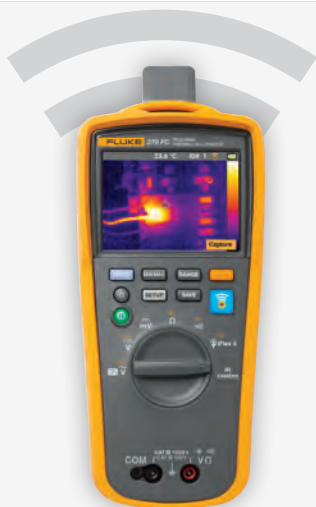
Fluke 279 FC