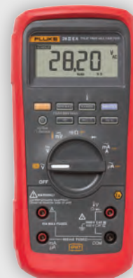
Fluke 28 II Ex