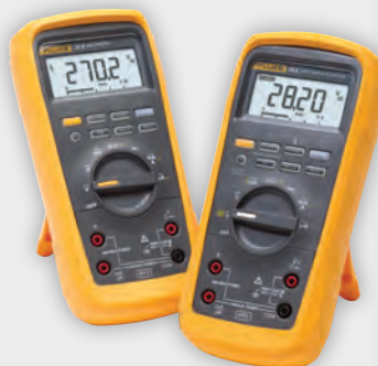
Fluke 28 II/27 II