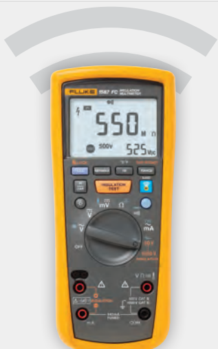
Fluke 1587 FC